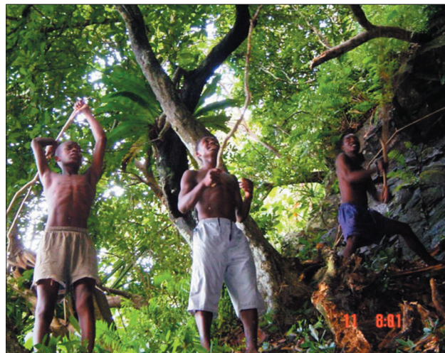
FIGURE 3. Hunting Rousettus madagascariensis on Nosy Boraha: one man in the cave disturbs the bats by throwing sticks and his fellow hunters wait at the cave entrance to strike emerging bats.

BATS AS BUSHMEAT There are few eye-witness accounts from biologists on the seasonality and frequency of hunting or the destination of the bat meat, and most reports are based