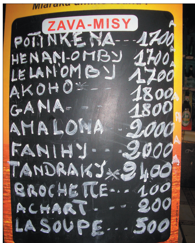
FIGURE 7. A menu in a roadside restaurant in western Madagascar during July 2007 showing the price of fruit bat fanihy as 2,000 ariary or $1 US. Other meats on the menu are omby (beef), akoho (chicken), gana (duck), amalona (eel) and tandraky (tenrec).

considered hunting to represent a minor threat to P. rufus in the north of Madagascar, but noted that this species was frequently served in local restaurants. Other evidence suggests that, at least locally, current patterns of exploitation are unsustainable and this is obviously of concern to conservationists and those who depend on the bats for income and nutrition. Local