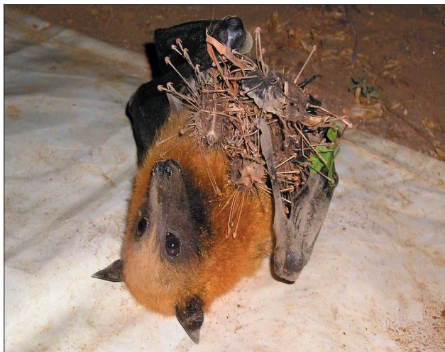
FIGURE 2. Pteropus rufus snared using hook-like plant burrs whilst feeding on kapok trees near Kirindy-Mite National Park

flyways were cleared in the vegetation surrounding the cave entrance and the bats were swatted with a wooden whip-like baton as they emerged (Figure 5).