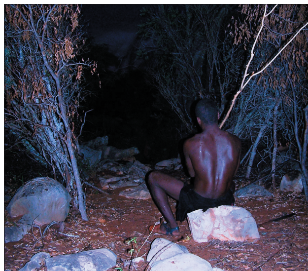
FIGURE 5. A hunter near Itampolo poised at the 'mouth' of a ride cut in the forest from the cave to channel the emerging Hipposideros commersoni towards his long stick.