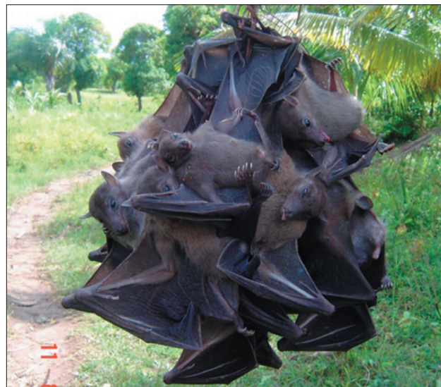
FIGURE 4. The results of a daily hunting trip to a cave roost of Rousettus madagascariensis on Nosy Boraha.