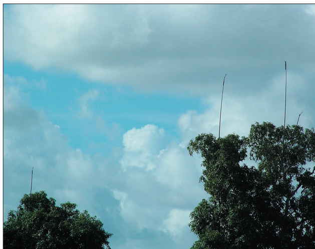
FIGURE 6. Support poles for nets set permanently around the edge of a Pteropus rufus roost in western Madagascar (Photo: R. Randrianavelona).

on informal interviews (Rakotoarivelo and Randrianandrianina 2007, Rakotonandrasana and Goodman 2007) or brief observations (Goodman 2006). Quantitative information in particular is lacking and this prohibits a thorough assessment of sustainability. Nevertheless, it is possible to obtain an overview of the way in which bat bushmeat is traded and used in Madagascar.